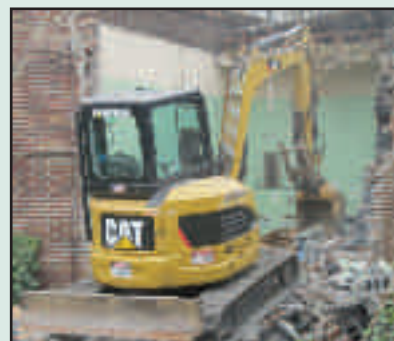
Tearing down a condemned portion of the new wing