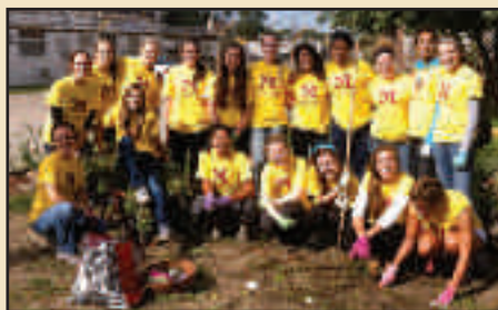
Mercy High School students helping with the Children's Garden Fall Clean-up