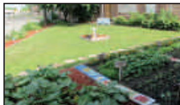
The Children's Garden before demolition. The crops survived!