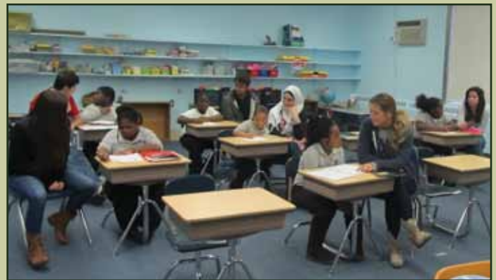
Wayne State University students working with our children in the after-school program.

Oakland University University of Michigan Washtenaw Community College Wayne State University