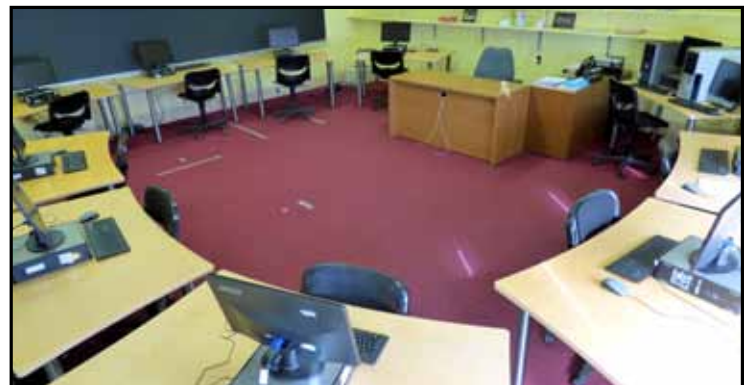
New Adult Computer Lab.

Sometimes blessings come in pairs! Thanks to two very supportive organizations, our Main Campus now features a new Adult Computer Lab, to help the students to prepare for the new computerized GED test. The computers and screens were generously donated by St. Kenneth Church in Plymouth, which has been an exceptional friend to the Center for 23 years.