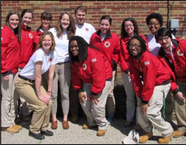
City Year Detroit

This year, the Center welcomed twelve City Year Detroit students in April for Spring Cleaning. They worked very hard quickly and enthusiastically tackling projects from washing windows, to moving access ramps, to cleaning every corner of the Center. They were a passionate group of young adults that are interested in making a difference and showed it, by rolling up their sleeves and getting their hands dirty! They were a joy to have with us and we are so grateful for their help!