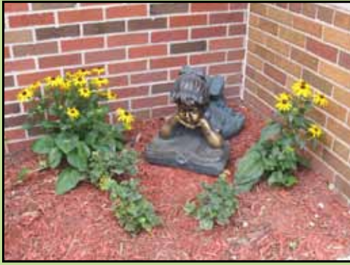
Picture of statue in Children's Courtyard.