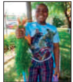
This year's first batch of carrots from the Children's Urban Garden and the proud farmer!

"I am a parent of two students that attended this year's Summer Learning Program. I am writing this letter to thank you for such a wonderful program. It is a pleasure to be able to send my children to this great summer learning experience. Two of my older children had the chance to enjoy this program in the past and it just keeps exceeding any of my expectations for learning. The environment is well rounded, stimulates learning, allows for growth, keep minds challenged and healthy lifestyles are promoted with physical activity and proper nutrition. Please continue to keep young minds working during the summer and after school. I can't thank you enough for such a great program along with your time and genuine effort to support our future by working with today's youth."