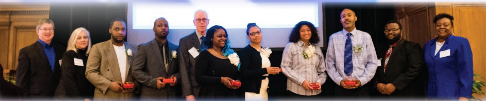
Some 2017 Graduates at the 2018 CTC Event.